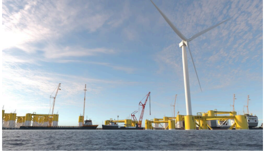
A rendering of Pier Wind, the Port of Long Beach's proposed 400-acre floating offshore wind assembly facility.

At the same time, the Port of Humboldt Bay received an $18.3 million state investment from California's Proposition 4 climate bond to prepare the region's first heavy-lift offshore wind port, a major infusion of capital for the North Coast and one of the largest industrial infrastructure commitments there in decades. Together, the projects anchor California's offshore wind supply chain while keeping this new industry, and its investment dollars, here in America.